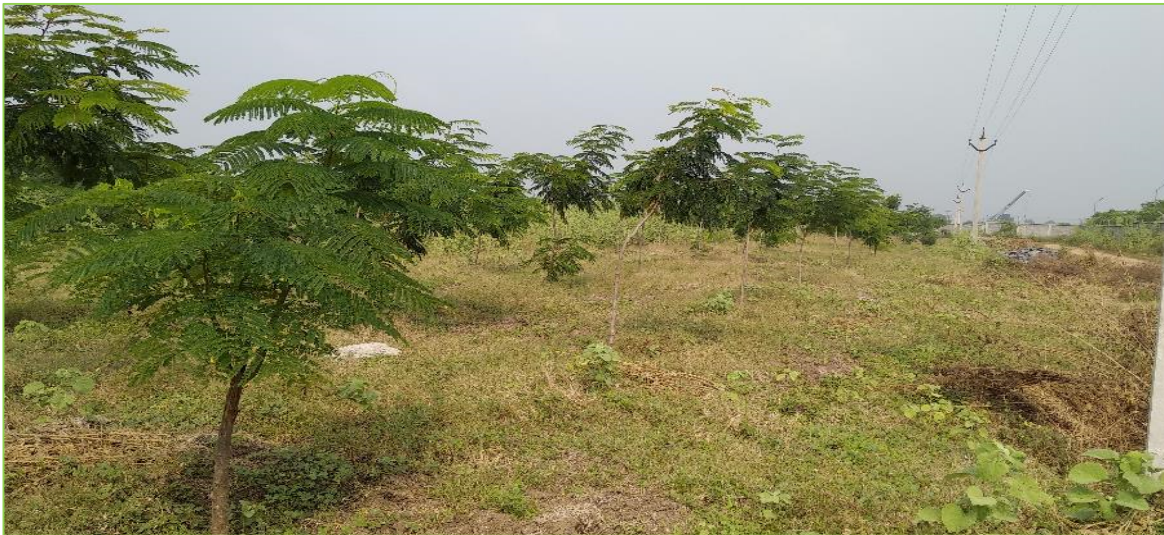
Plantation in Mine lease & along the lease boundary